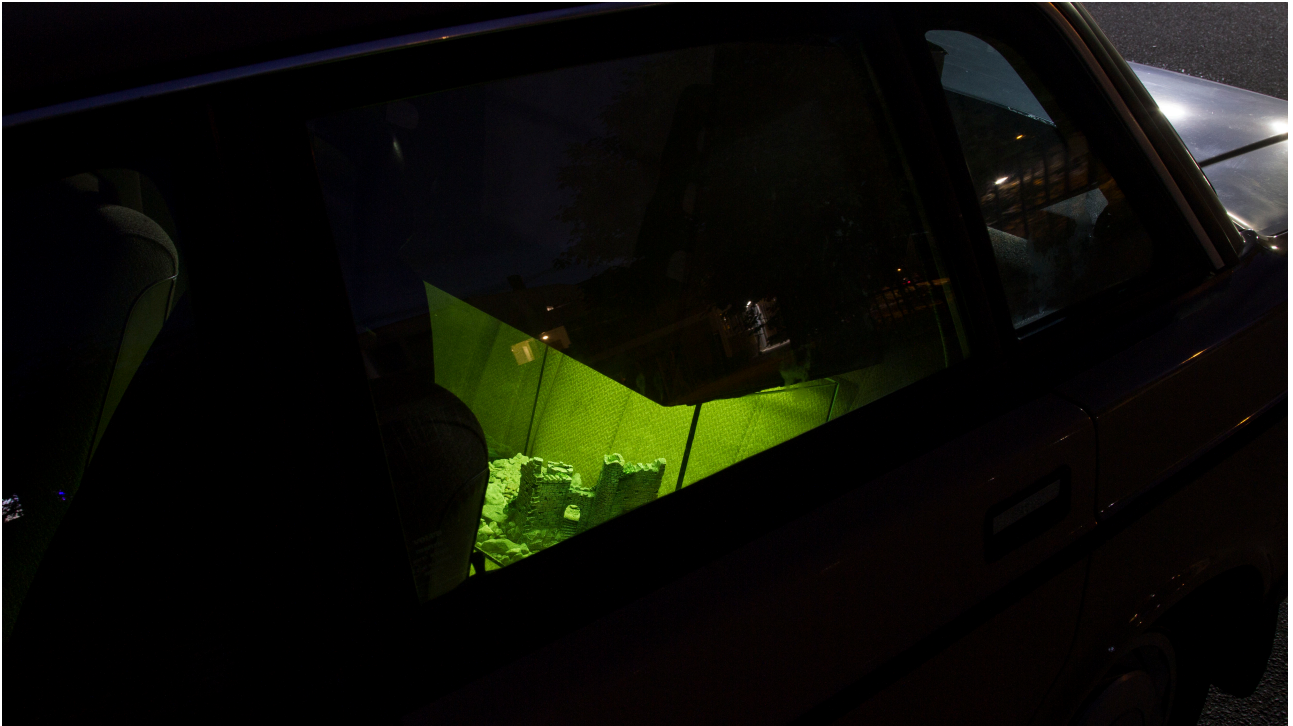
Detail, car interior (night view): Aquarium (with gravel from a parking lot, green LED lights, decorative castle ruin); cardboard box