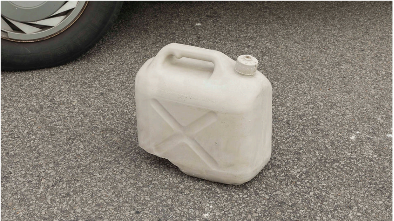
Detail: Plaster replica (jerrycan)