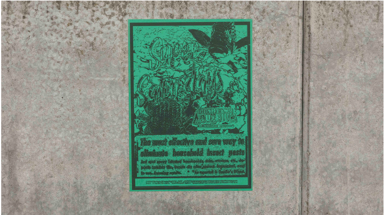
Detail: Inkjet print on recycled paper 297 x 420 mm (A3)