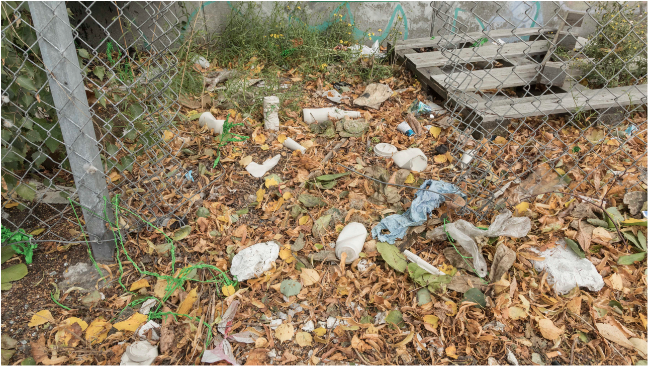
Detail (left to right): Chroma key-painted weeds; plaster replicas; faux rocks (soda cans, energy drink cans, beer cans, takeaway coffee lids, skeletal remains from a dog, permanent markers)