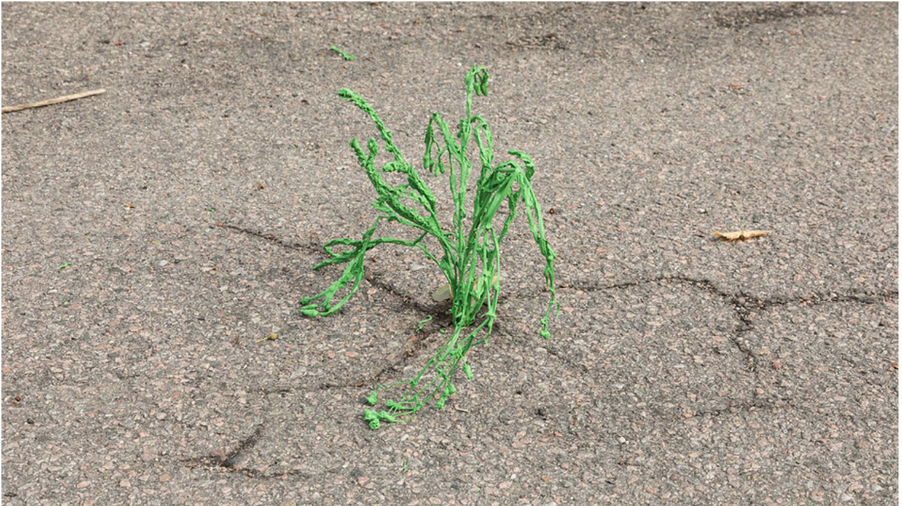
Detail: Chroma key-painted weeds