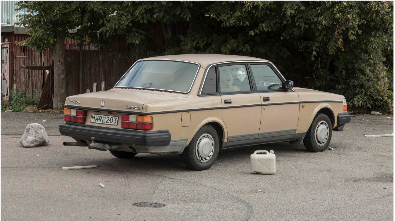
Installation view (left to right): Chroma key-painted weeds; faux rock (ink and acrylic paint on cement and plaster-covered cardboard and chicken wire armature); 1986 Volvo 240 DL; plaster replicas