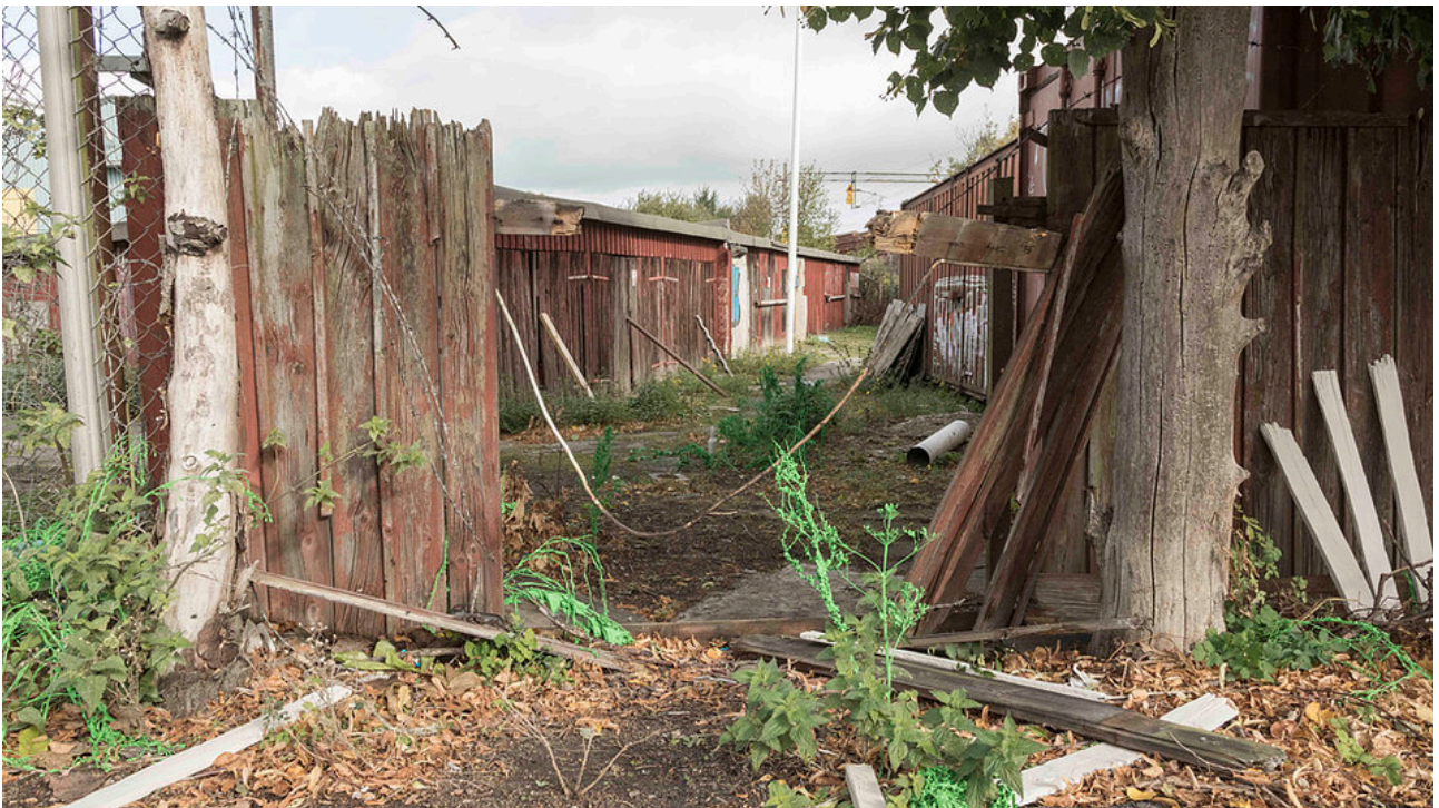
Installation view (left to right): Chroma key-painted weeds; plaster replicas (planks of wood)