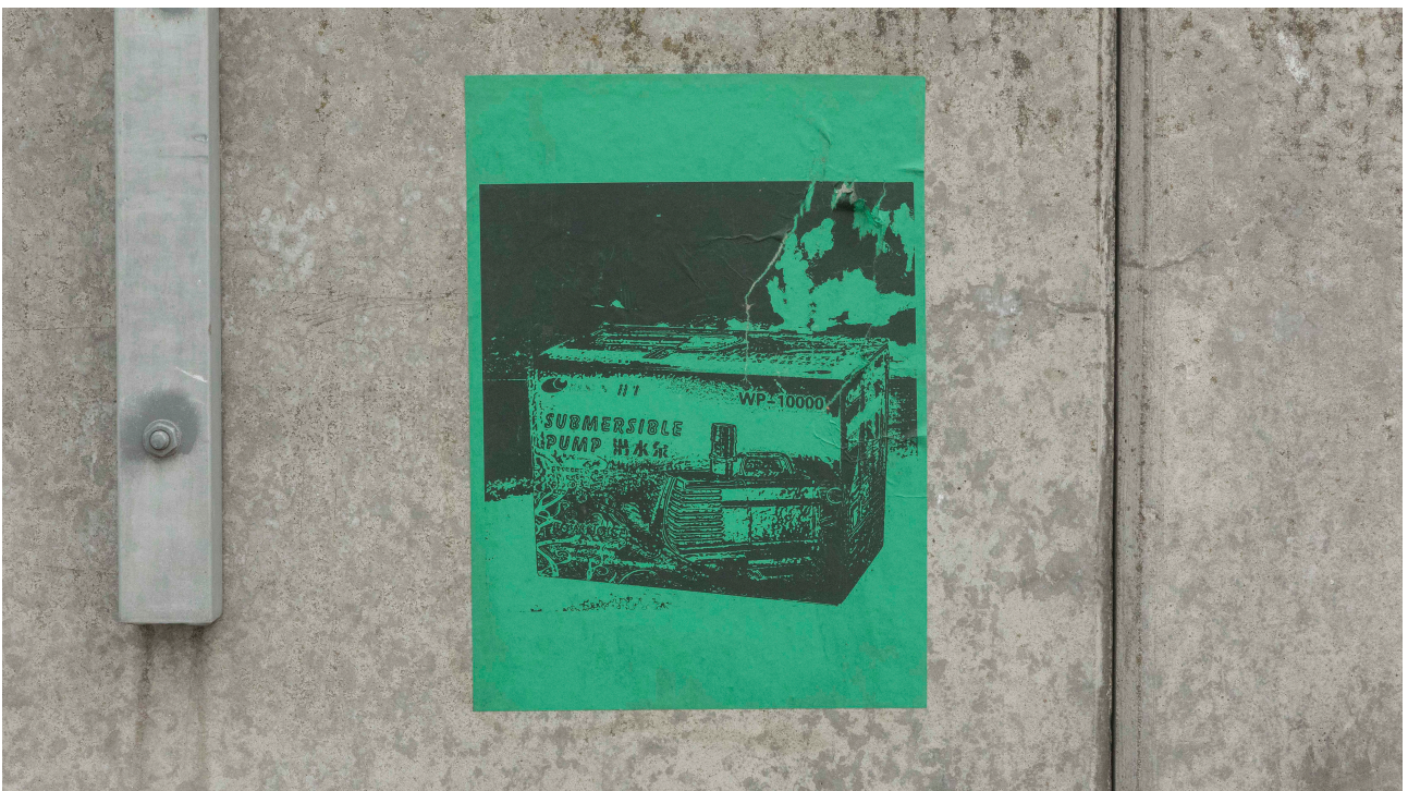
Detail: Inkjet print on recycled paper 297 x 420 mm (A3)