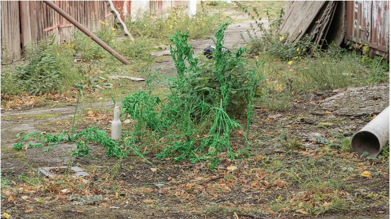
Detail (left to right): Plaster replica (beer bottle); chroma key-painted weeds