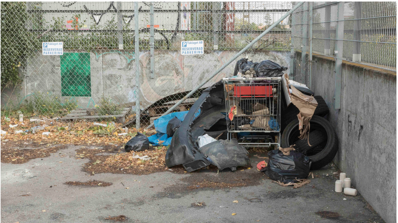
Detail (left to right): Chroma key-painted weeds; plaster replicas; inkjet print on recycled paper; trash pile