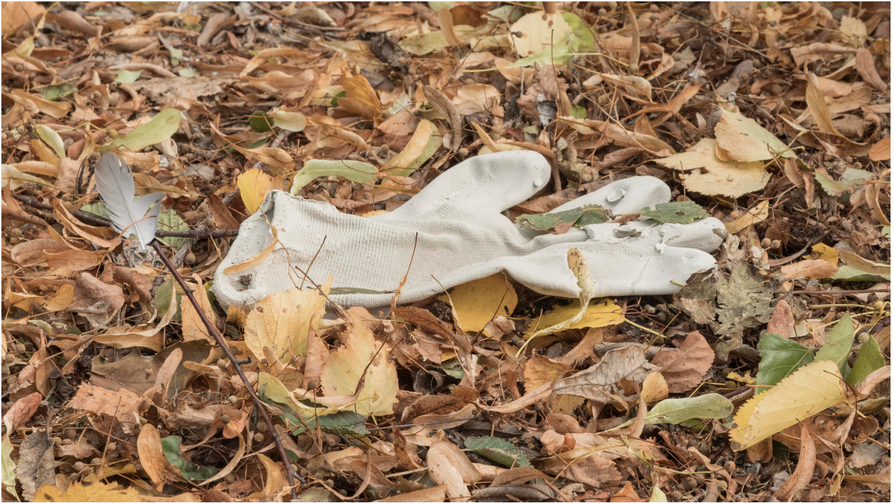
Detail: Plaster replica (gardening glove)