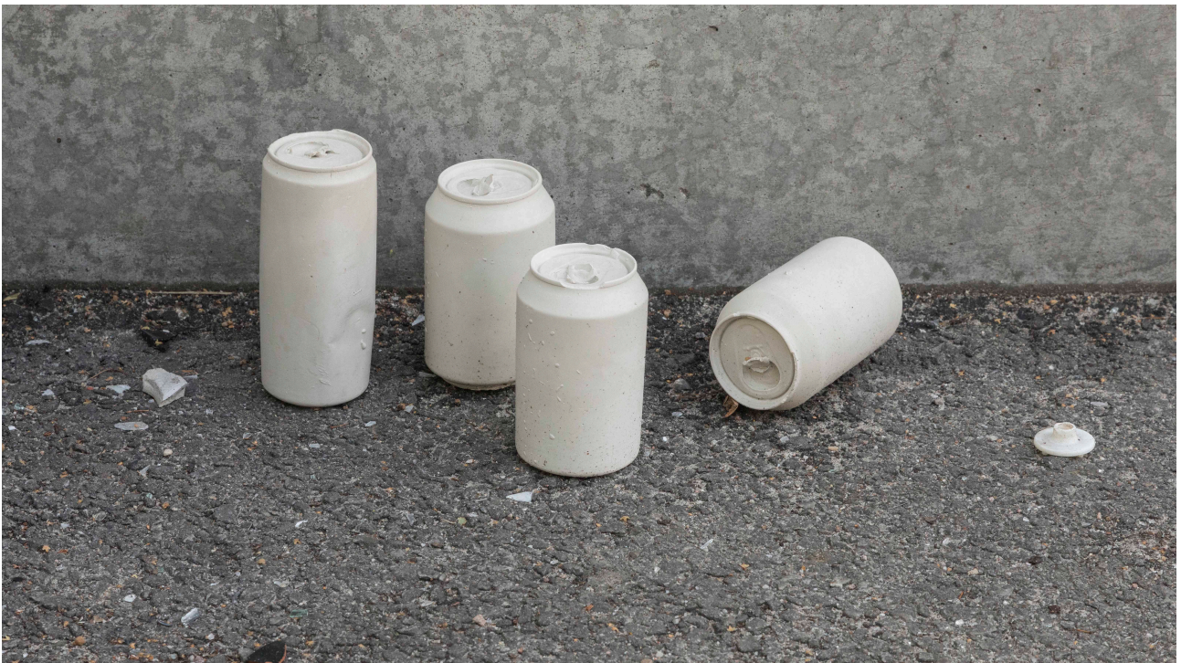
Detail: Plaster replicas (energy drink can, beer cans)