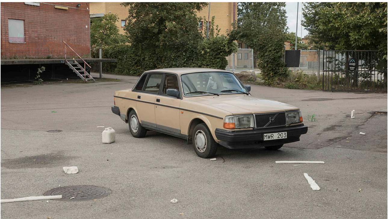
Installation view: 1986 Volvo 240 DL; plaster replicas