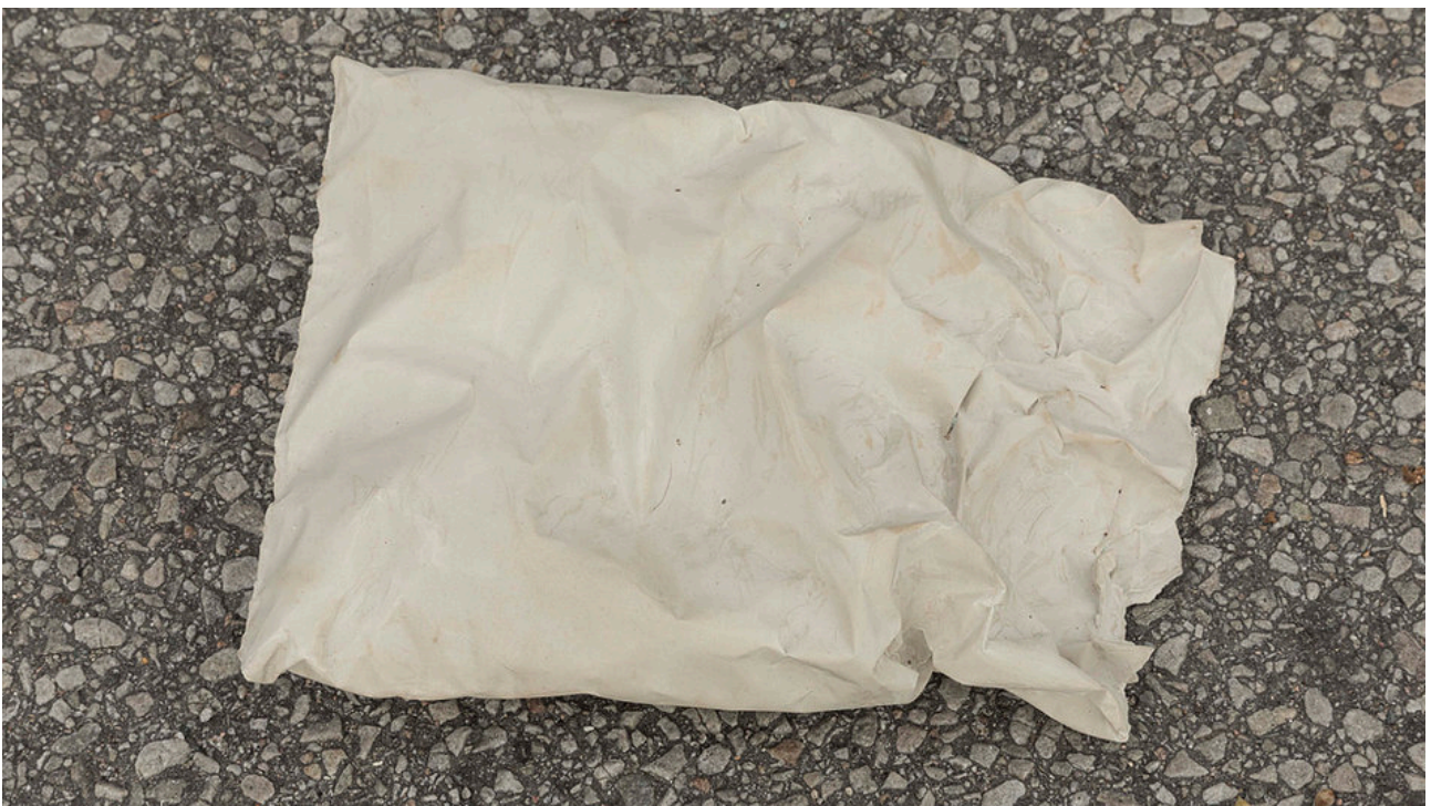
Detail: Plaster replica (paper bag)