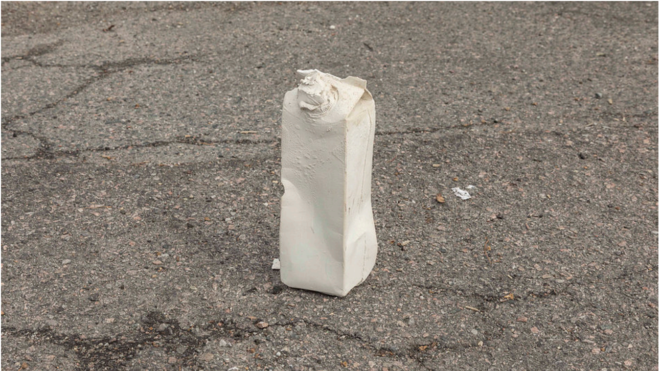
Detail: Plaster replica (milk carton)