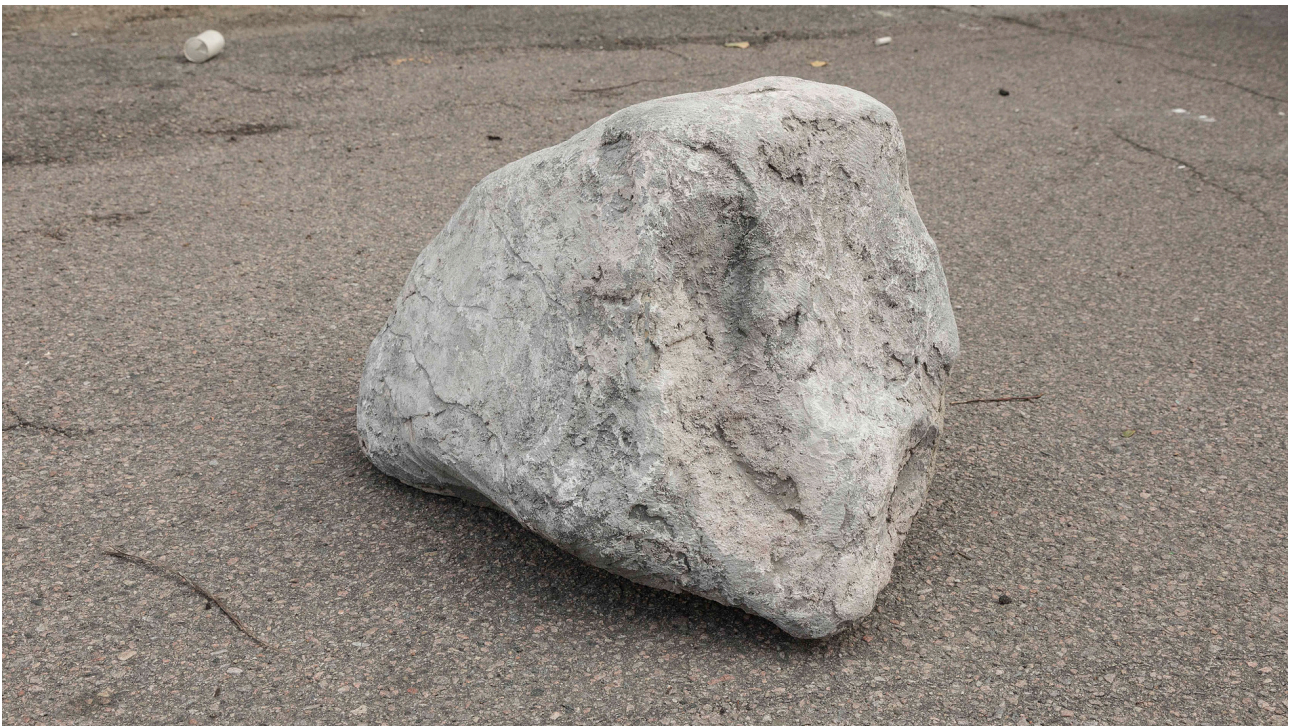
Detail (left to right): Plaster replica (soda can); faux rock (ink and acrylic paint on cement and plaster-covered cardboard and chicken wire armature)