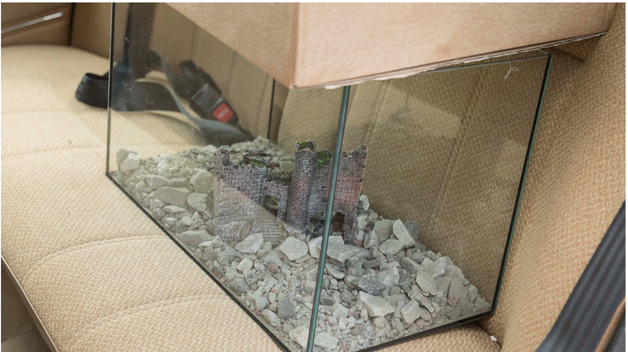
Detail, car interior: Aquarium (with gravel from a parking lot, green LED lights [off], and decorative castle ruin); cardboard box