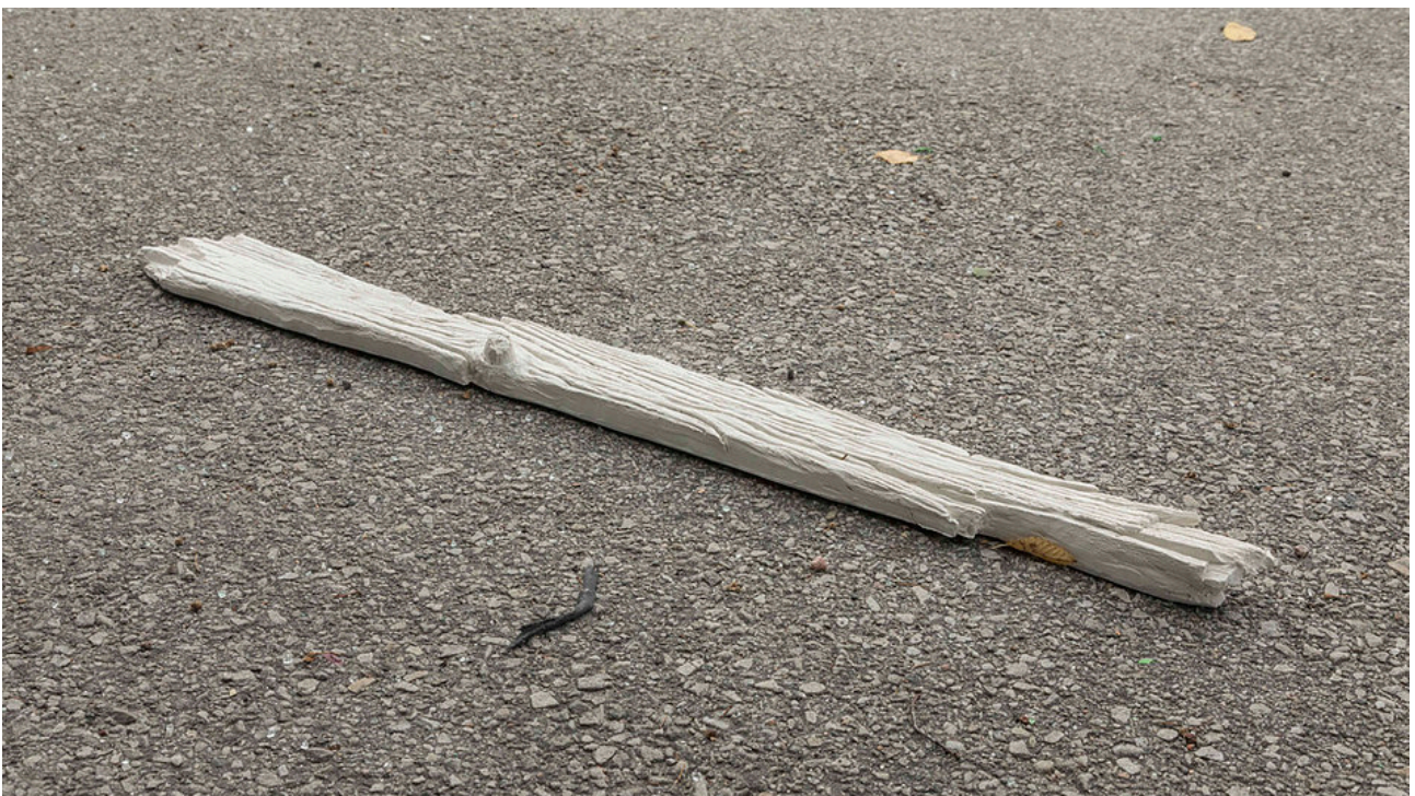
Detail: Plaster replica (plank of wood)