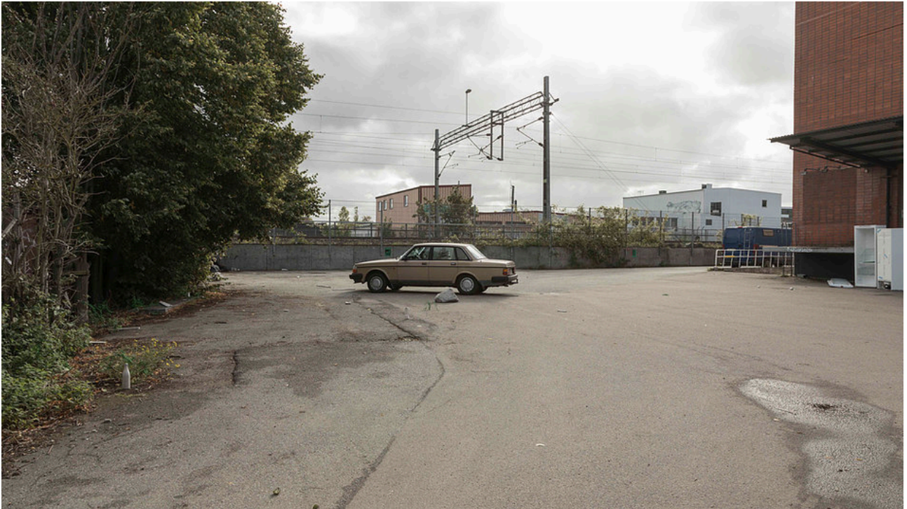
Installation view: Celsiusgatan 45, Malmö, Sweden