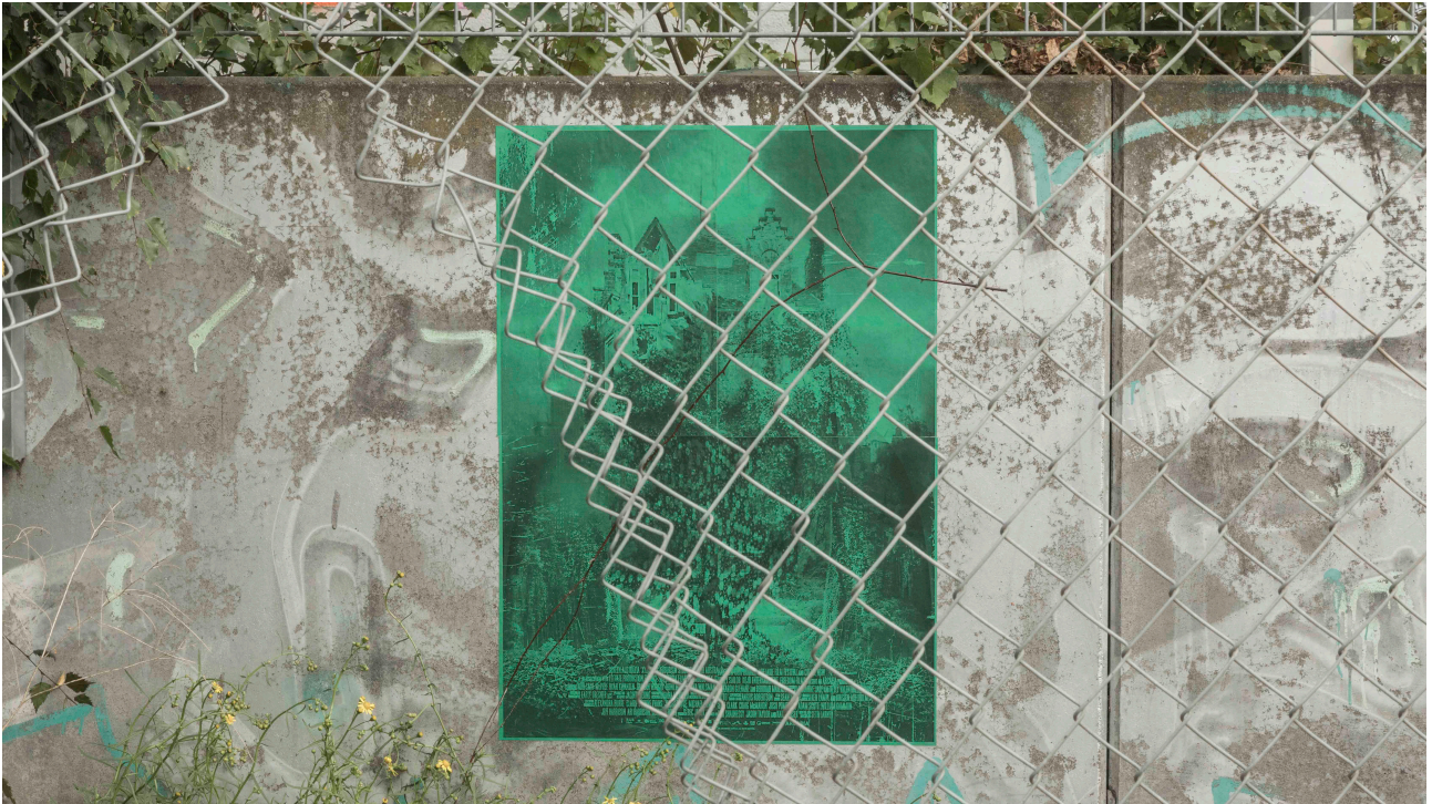
Detail: Inkjet print on recycled paper 594 x 840 mm (A3x4)