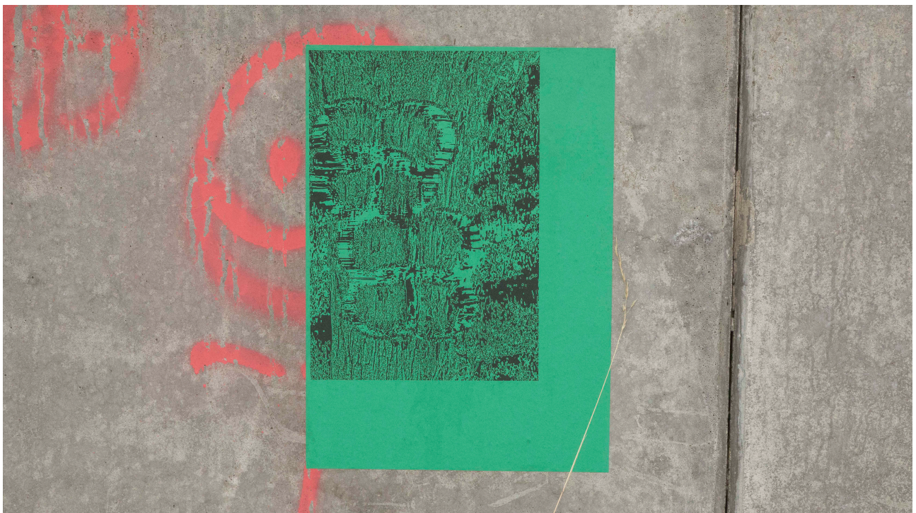
Detail: Inkjet print on recycled paper 297 x 420 mm (A3)