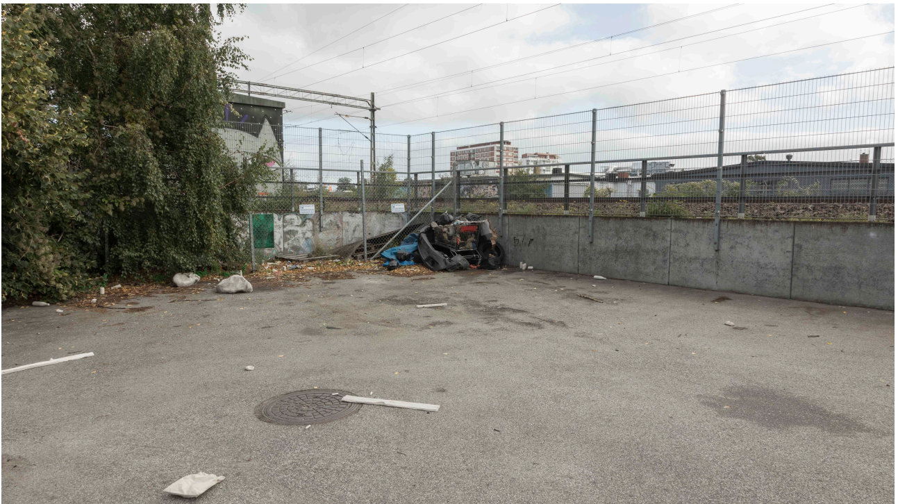
Installation view (left to right): Plaster replicas; faux rocks (ink and acrylic paint on cement and plaster-covered cardboard and chicken wire armature); inkjet print on recycled paper; trash pile