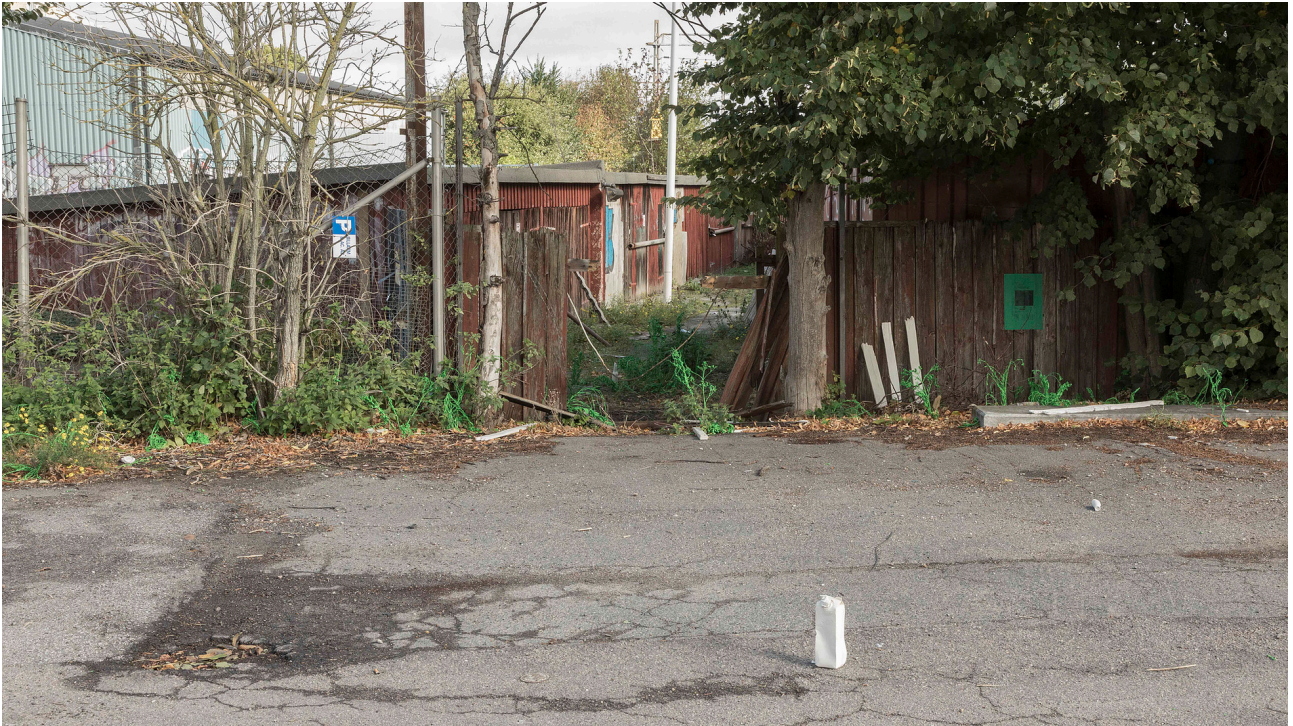
Installation view (left to right): Chroma key-painted weeds; plaster replicas (planks of wood, milk carton, coffee lids, energy drink can, lighters, AA batteries); inkjet print on recycled paper