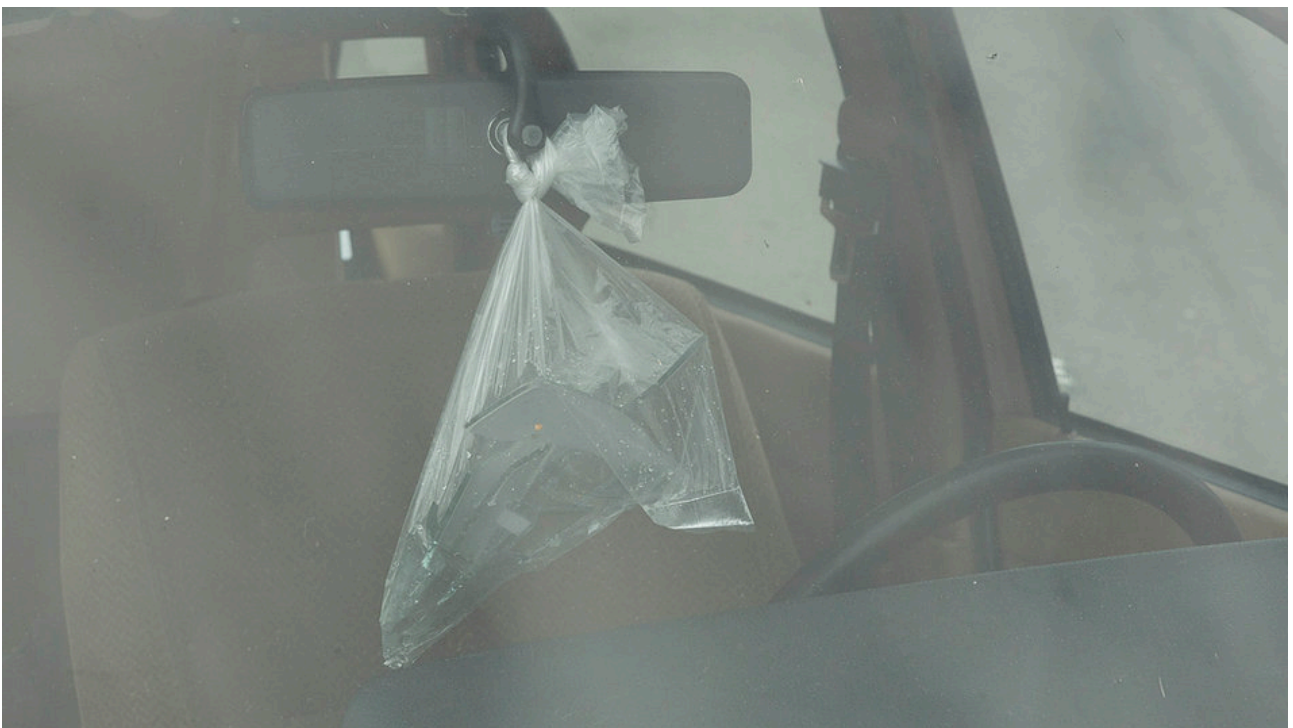
Detail, car interior: Broken mirror and clear resin within plastic bag